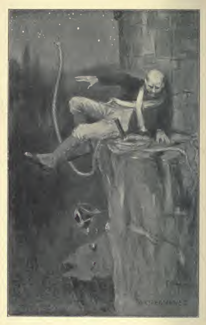
For more than a minute he hung suspended over the abyss into which the baron had just fallen, and his hands clutched at the empty air.